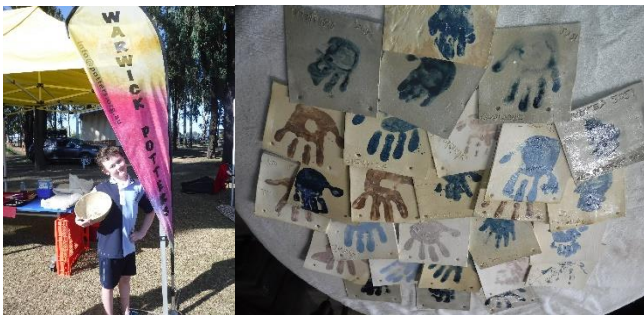
Under 8's Day