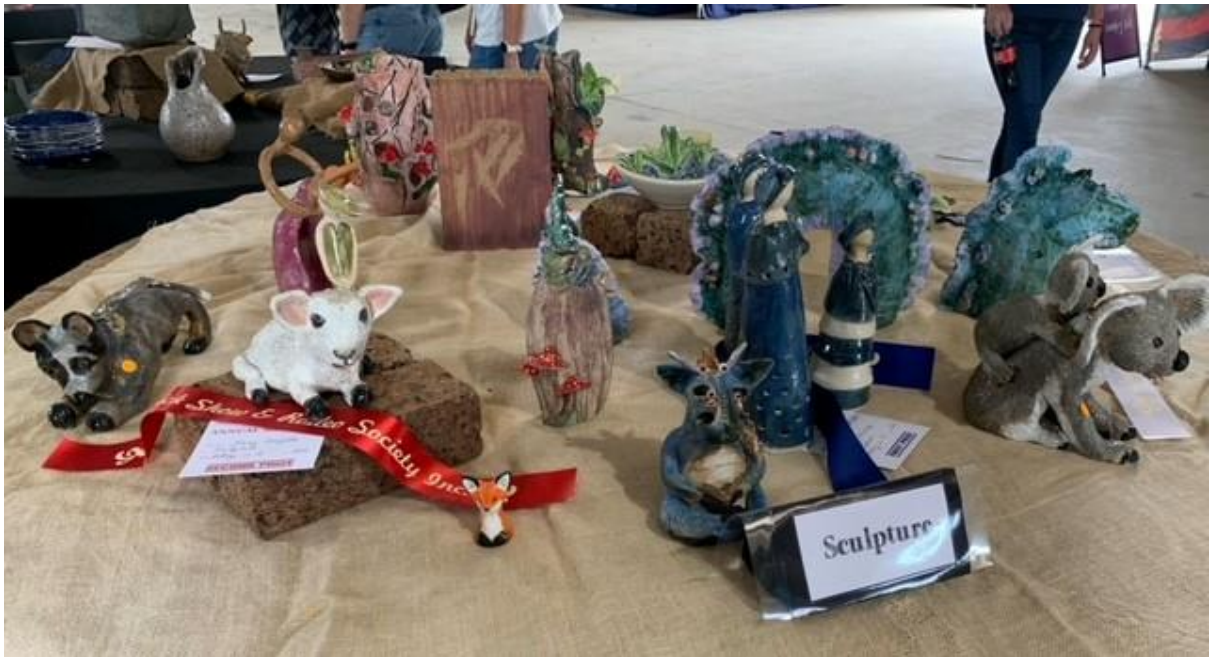
Children Primary, Mixed Media, Wheel Thrown