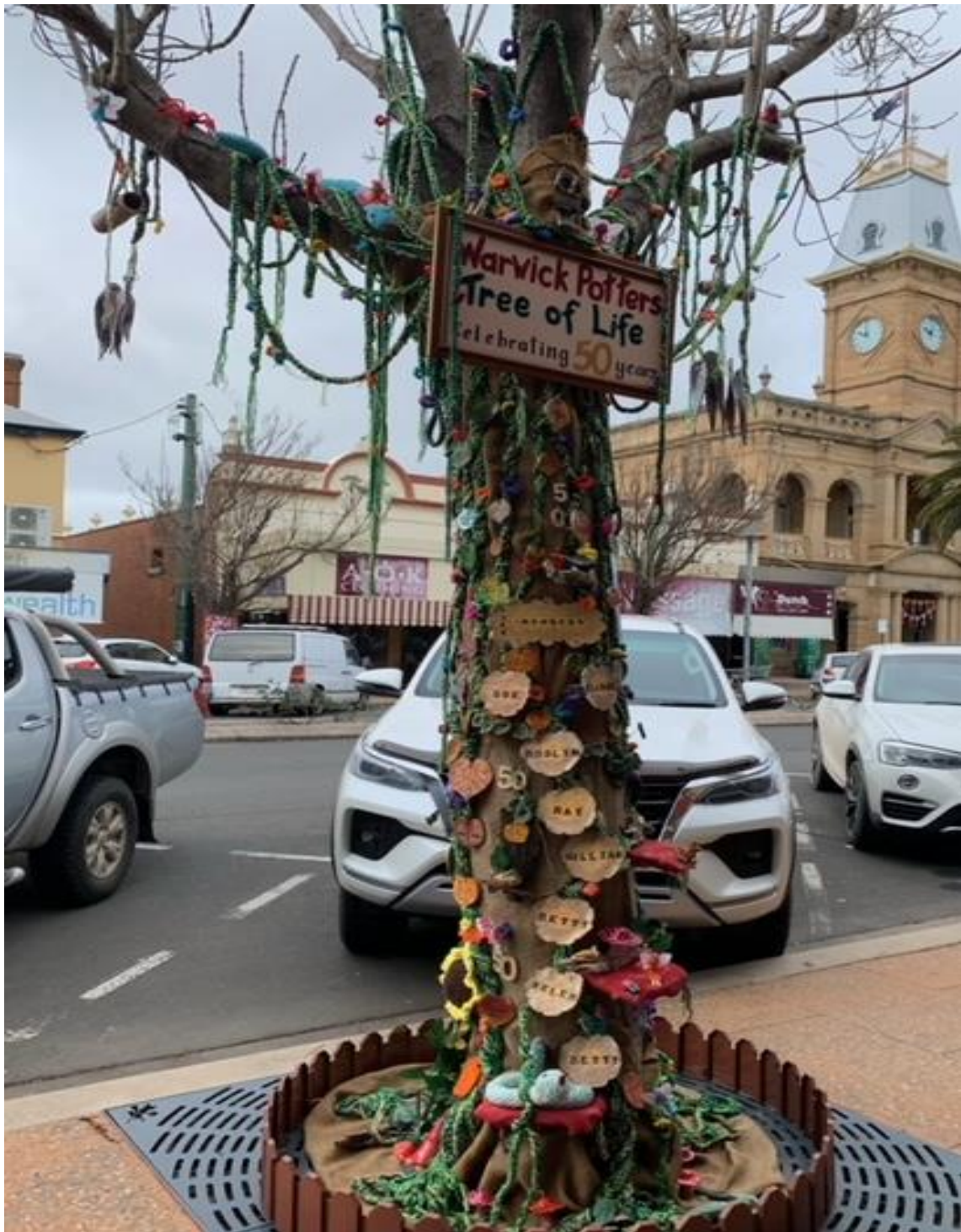
First Place in Free Choice – congratulations to everyone who lent a hand. An amazing effort and you should all take a bow.