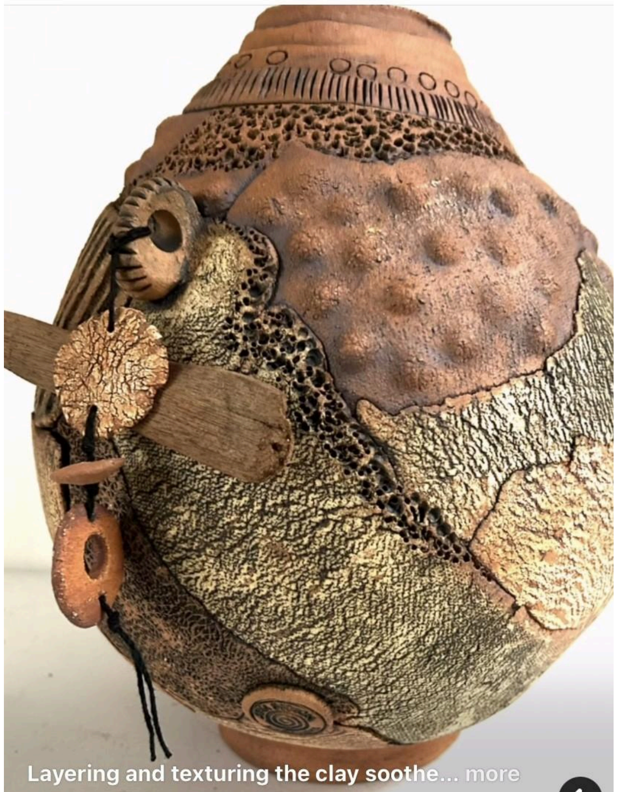
Layering and texturing the clay soothe... more